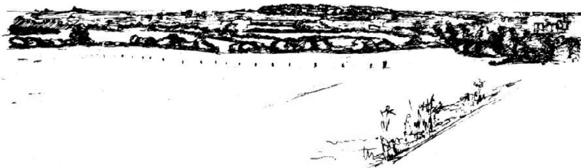
VIEW FROM IPSLEY HILL.

Proceed towards the large building on the hill. Ipsley Court was built for the Huband family in Queen Elizabeth I's reign, although only a small part remains. The two wings are late 17th century but the central building was demolished. The wing on the right was recently used as a barn, the other as a farmhouse. An owner, Walter Savage Landor, wrote about Ipsley Court in 1830 - "Never was any habitation more thoroughly odious - red soil, mince pie woods and black and greasy needle-workers". The tree adjacent to the fence is a walnut. It is said that you can see Edgehill from Ipsley Hill on a clear day if you look in the right direction!